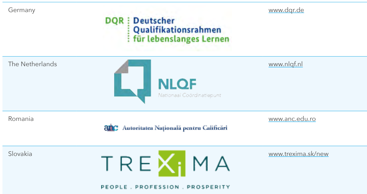
Table 1 Overview of national organisations in the EQF context

On one hand the transport is still more economical than any other mode of transport for many types of cargo, particularly such as bulk, general, liquid cargo and containers. On the other hand, it is the friendliest mode to the environment.